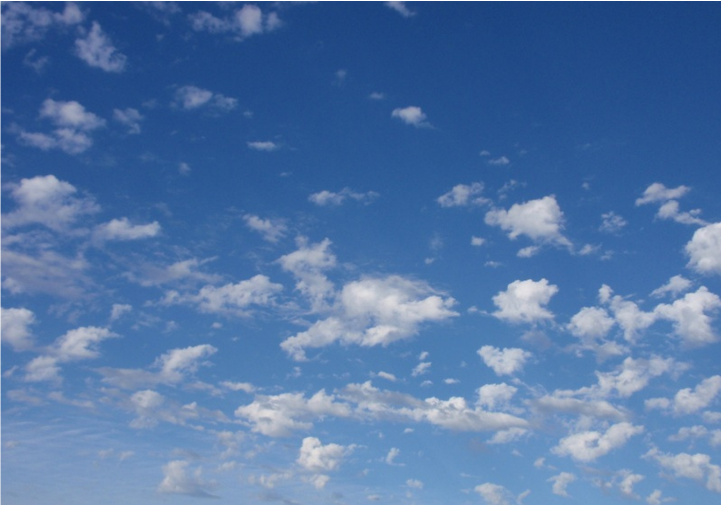
The weather was perfect. Why not go flying?