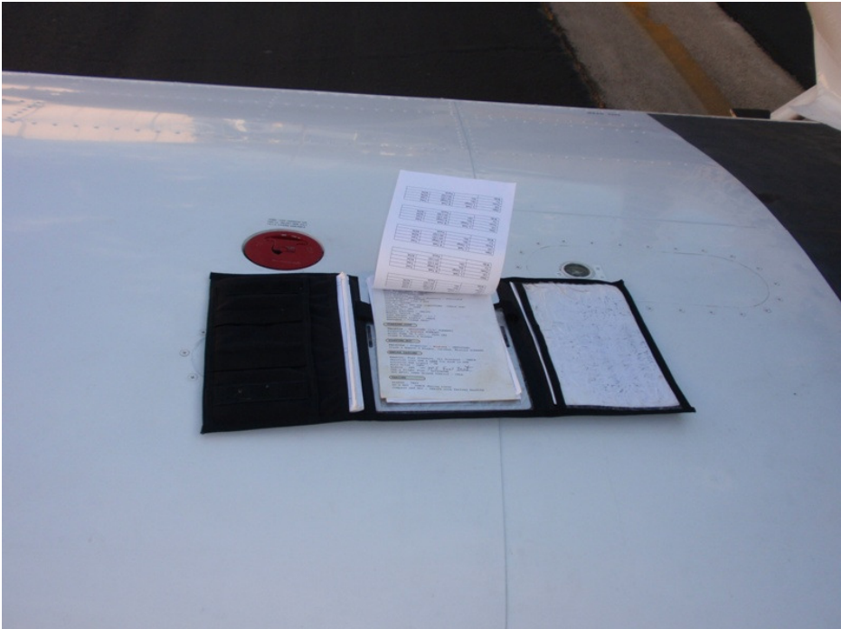
I filled out my log info noting exactly how much fuel and oil were onboard