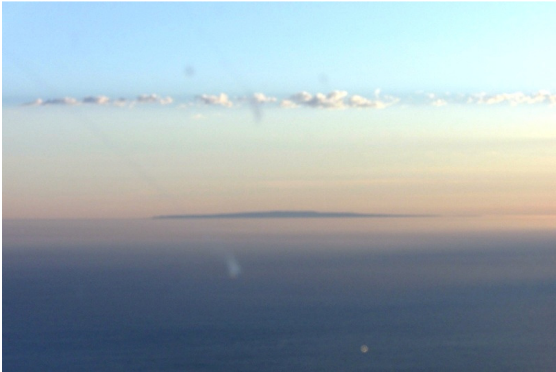
Looking offshore, it was so peaceful - we were just sitting there and enjoying