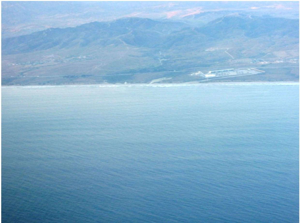
In the shade, the colors are muted - but the fun wasn't